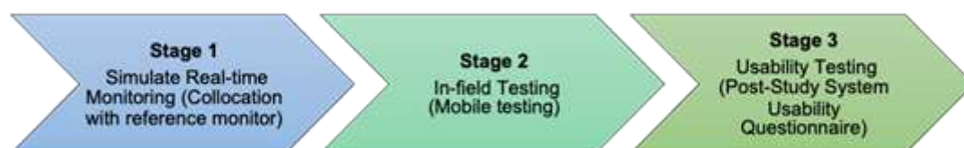
Figure 1. Proposed three-stage framework for evaluation of wireless outdoor individual exposure indicator system