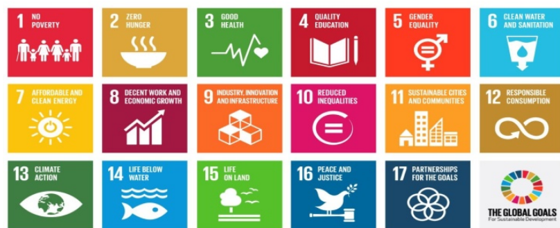
Figure 1. Sustainable Development Goals

Agenda 2030 on SDGs started on 1 st January 2016 and is effective for 15 years until 2030 and is the expansion to Millennium Development Goal as outlined in Figure 1.